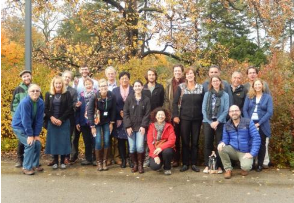
IUCN/SSC Global Tree Specialist Group Morton Arboretum 2015