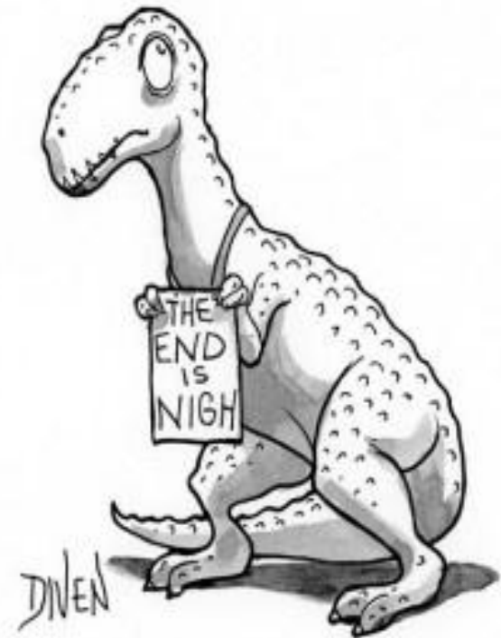
Illustration copyright Bob Diven

It is not a list of species that are priorities for conservation action